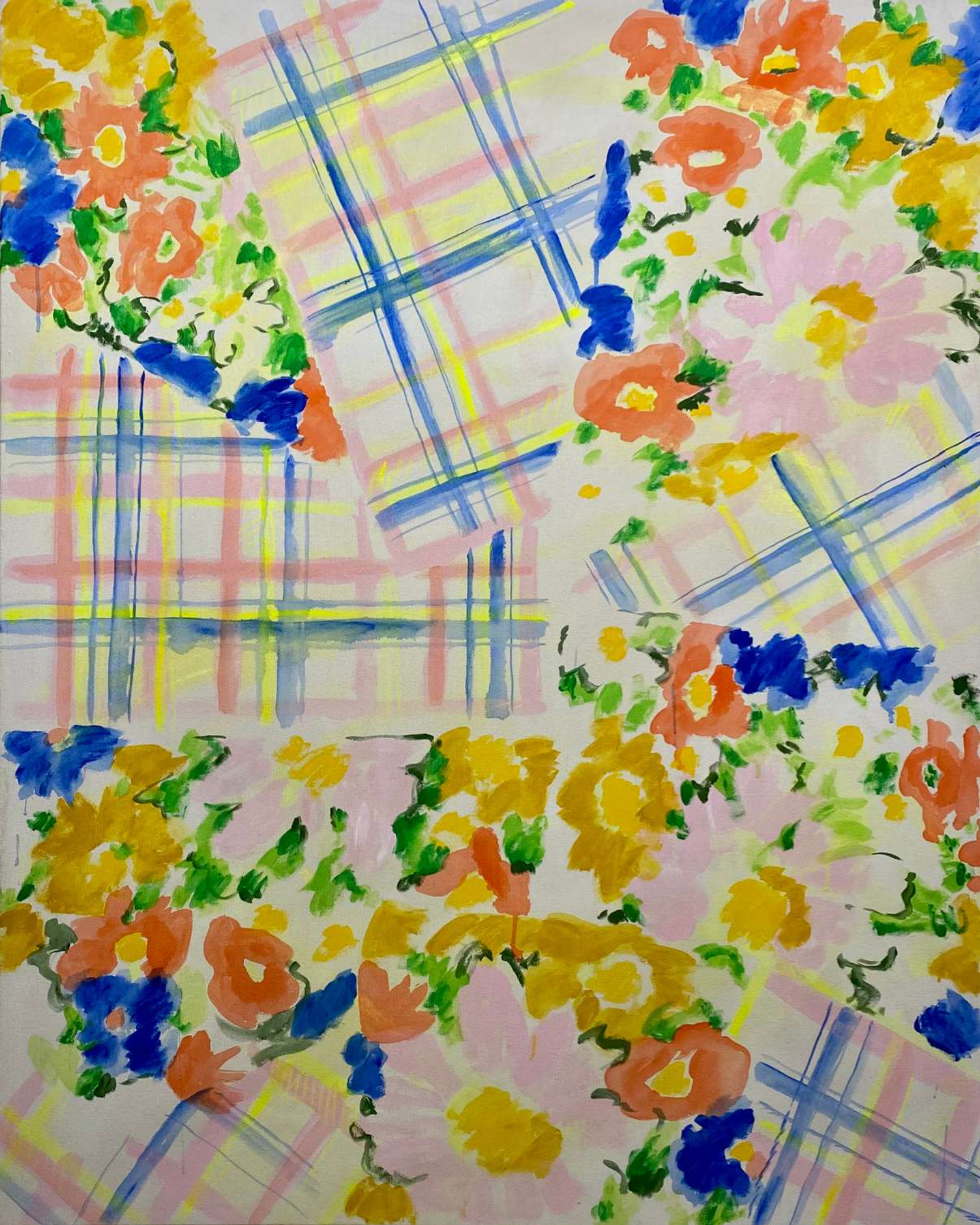
Pia Pack Picnic No.4 2022 Oil on canvas 152 x 120 cm £6000