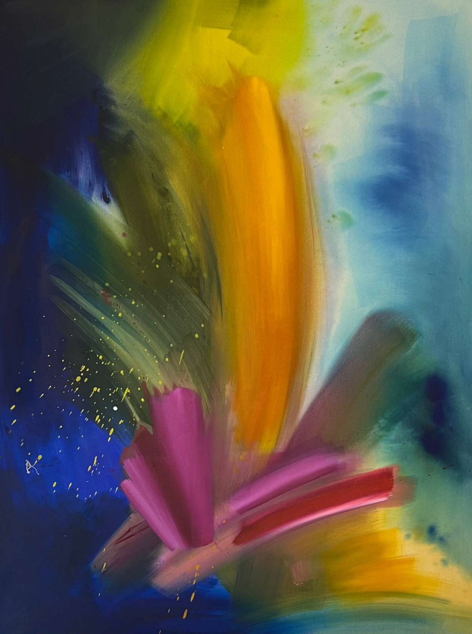
Ptolemy Mann The Energy of Love 2023 Acrylic on canvas 200 x 150 cm £22,000