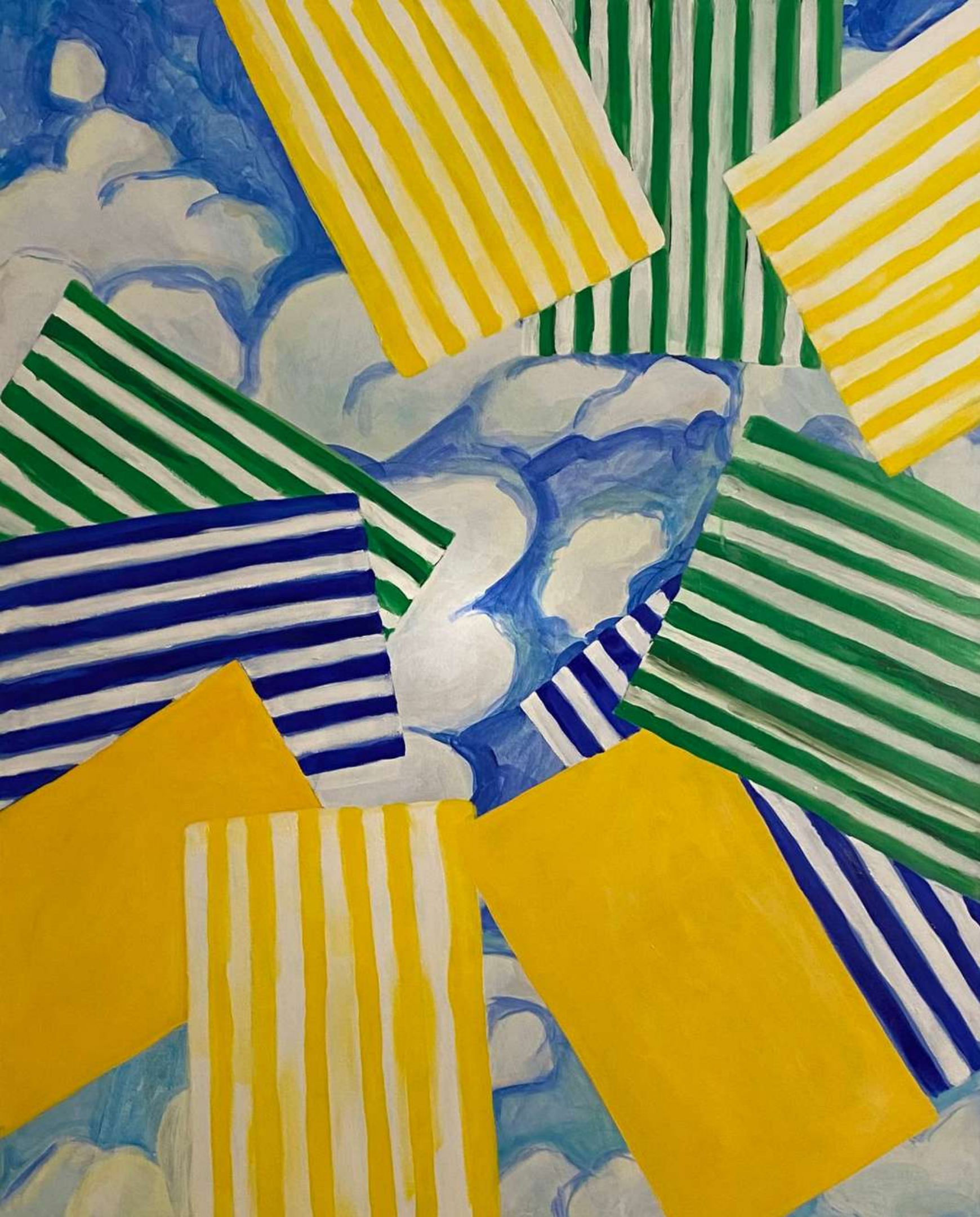
Pia Pack Sunshine Picnic 2020 Oil on canvas 152 x 120 cm £4000