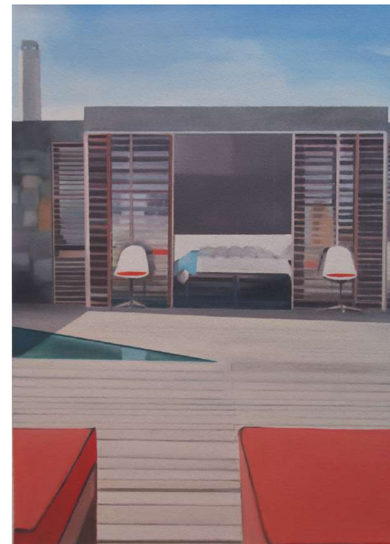
Alexandra Baraitser Deck Delicious 2022, Oil on canvas 70 x 50 cm £2500