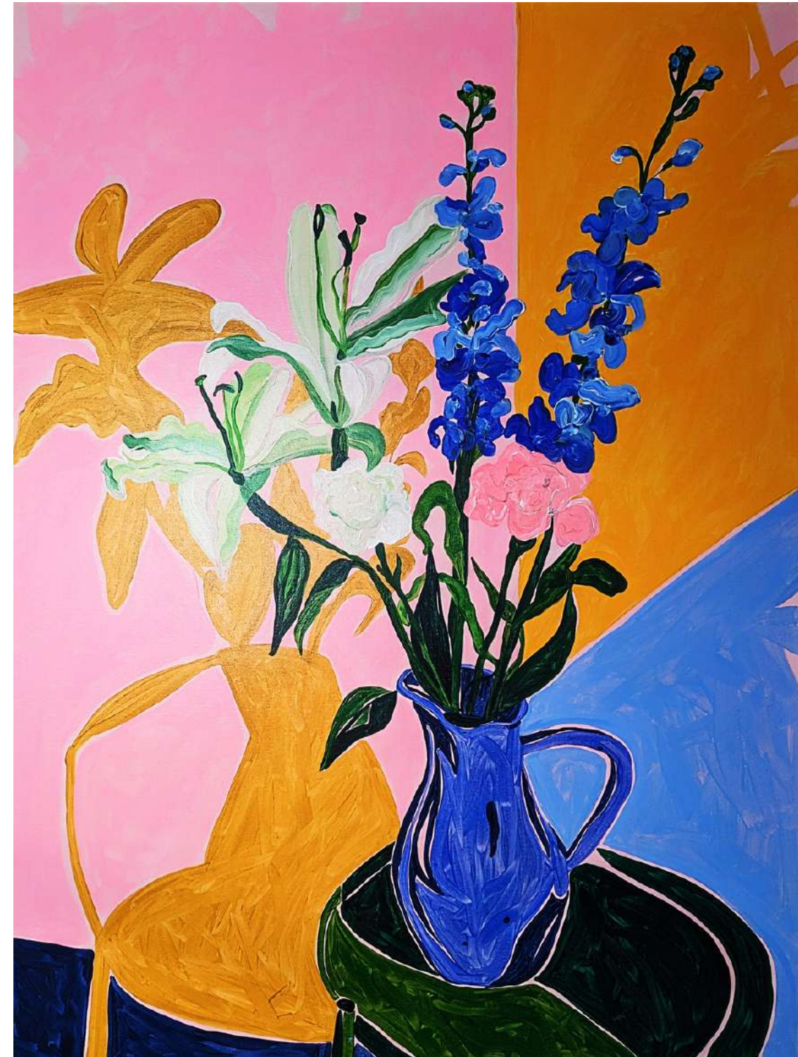
Elizabeth Power Love Delight 2023 Acrylic on canvas 126 x 95 cm £2200