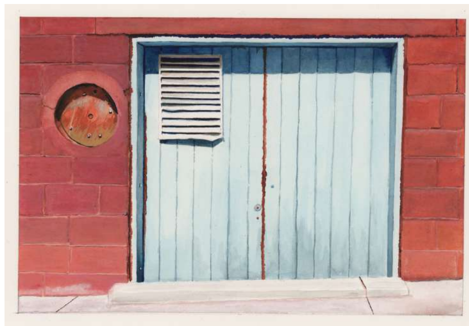
Lyle Perkins Aperture 07 2021, Gouache on paper 36.3 x 44 cm £750