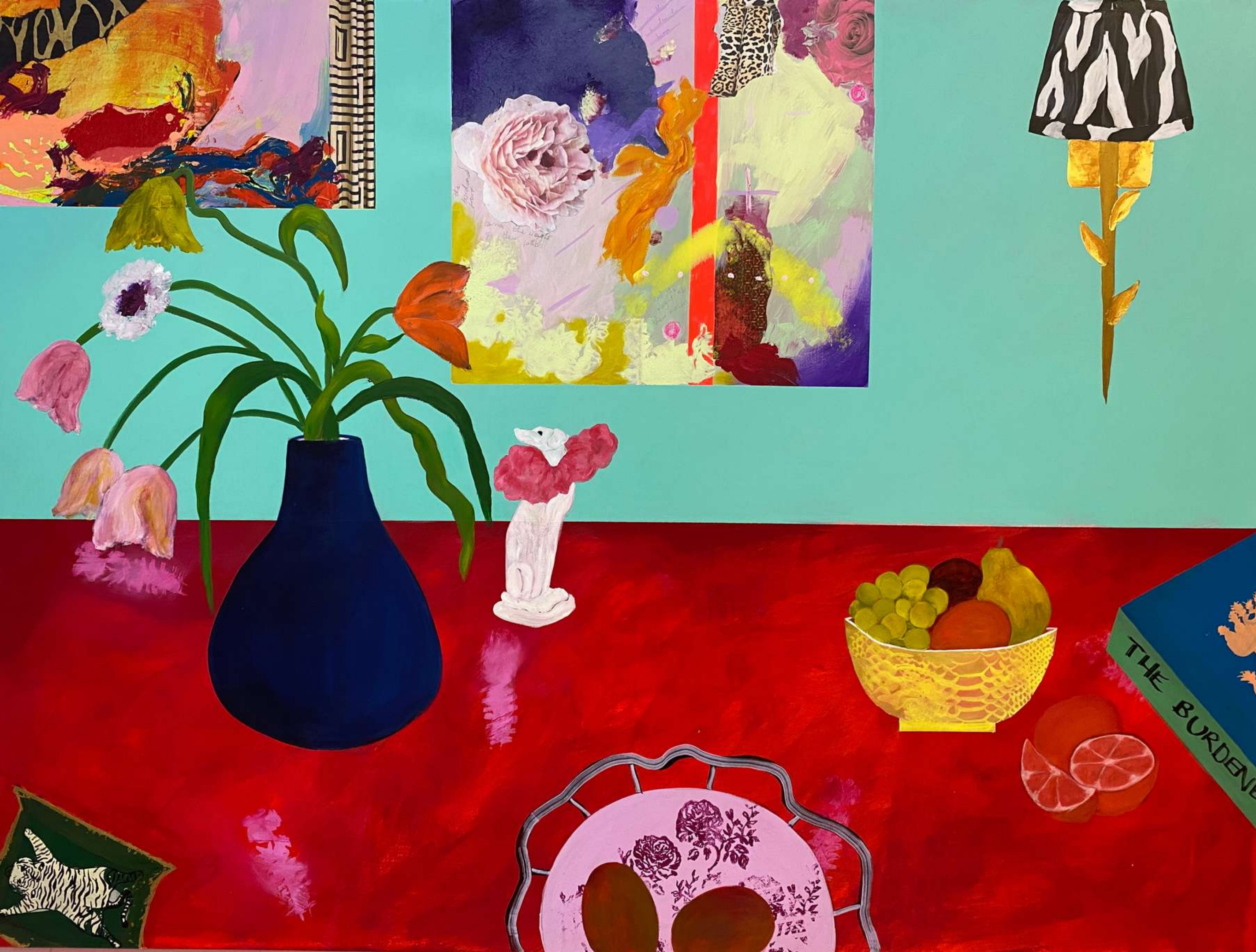
Dawn Beckles The Burdened Acrylic and collage on canvas 120 x 160 cm £5995