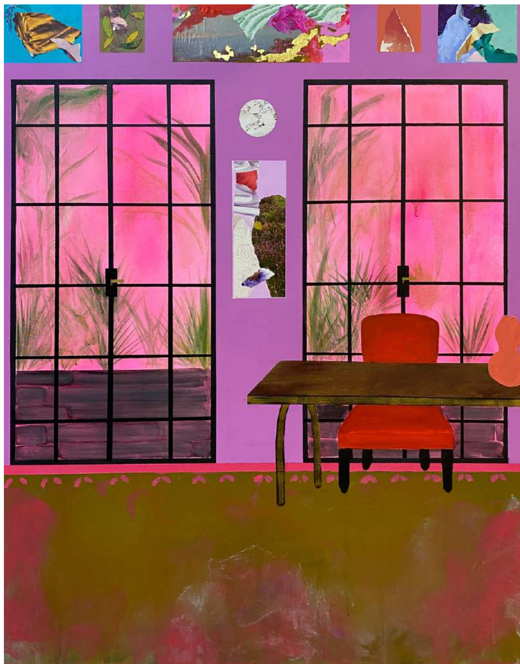
Dawn Beckles There Are No Words Acrylic and collage on canvas 100 x 80 cm £2495