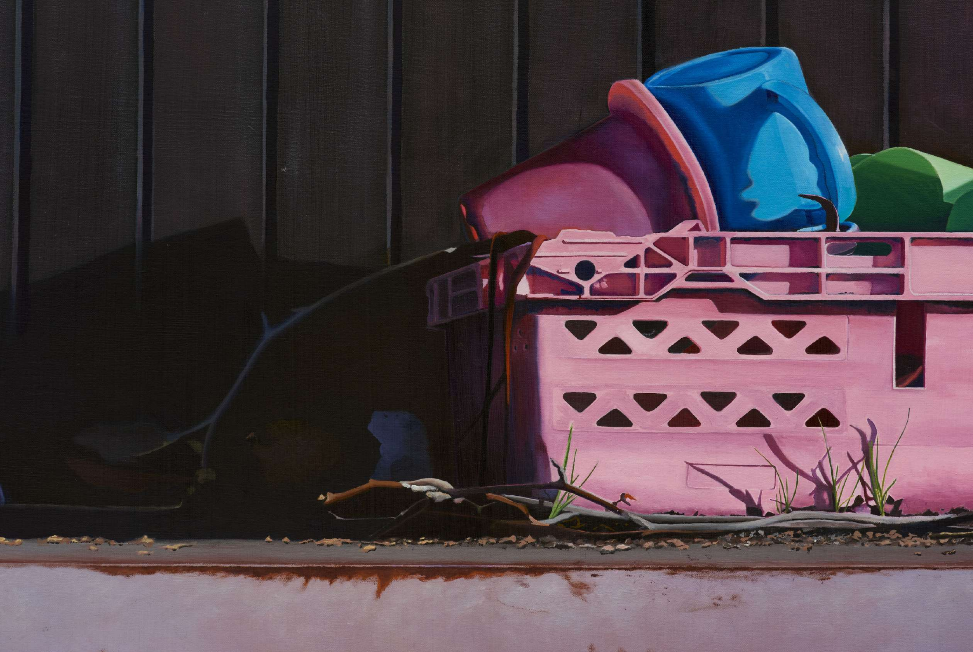
Lyle Perkins Fairfax Meadow 2022 Oil on canvas 122 x 183 cm £7500