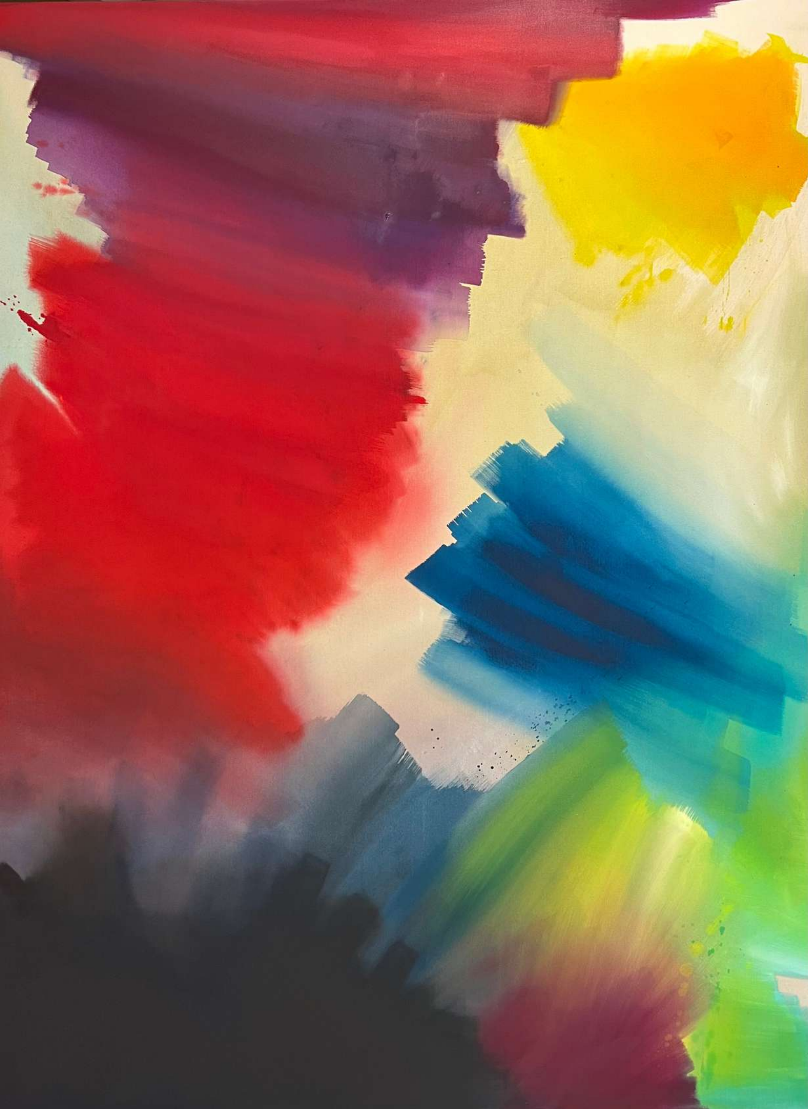
Ptolemy Mann After Buffie Johnson 2023 Acrylic on canvas 200 x 150 cm £22,000