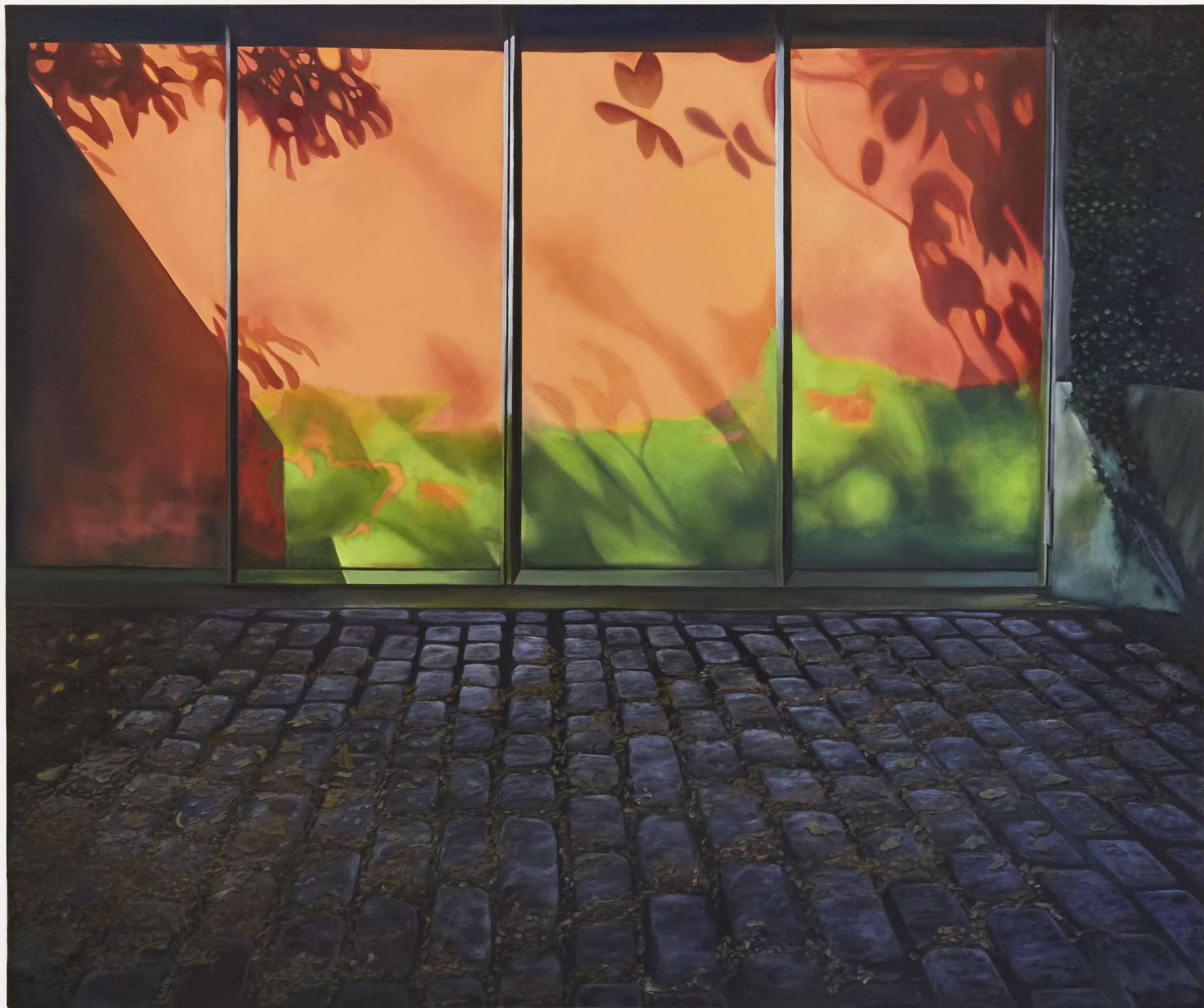
Lyle Perkins Millfield 2019 Oil on canvas 127.5 x 152.5 cm £5500