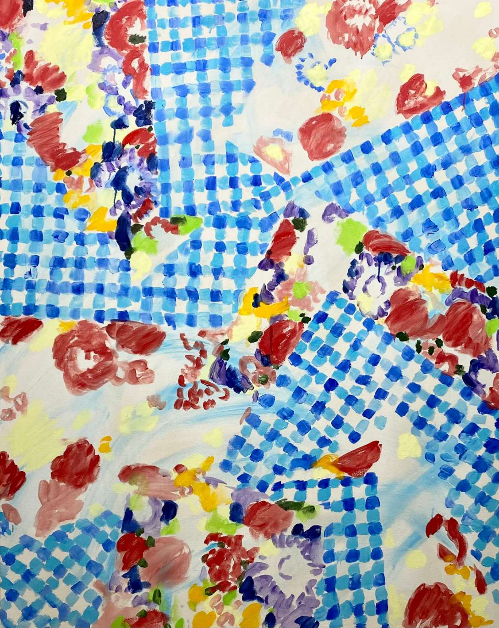
Pia Pack Picnic No.3 2022 Oil on canvas 152 x 120 cm £6000