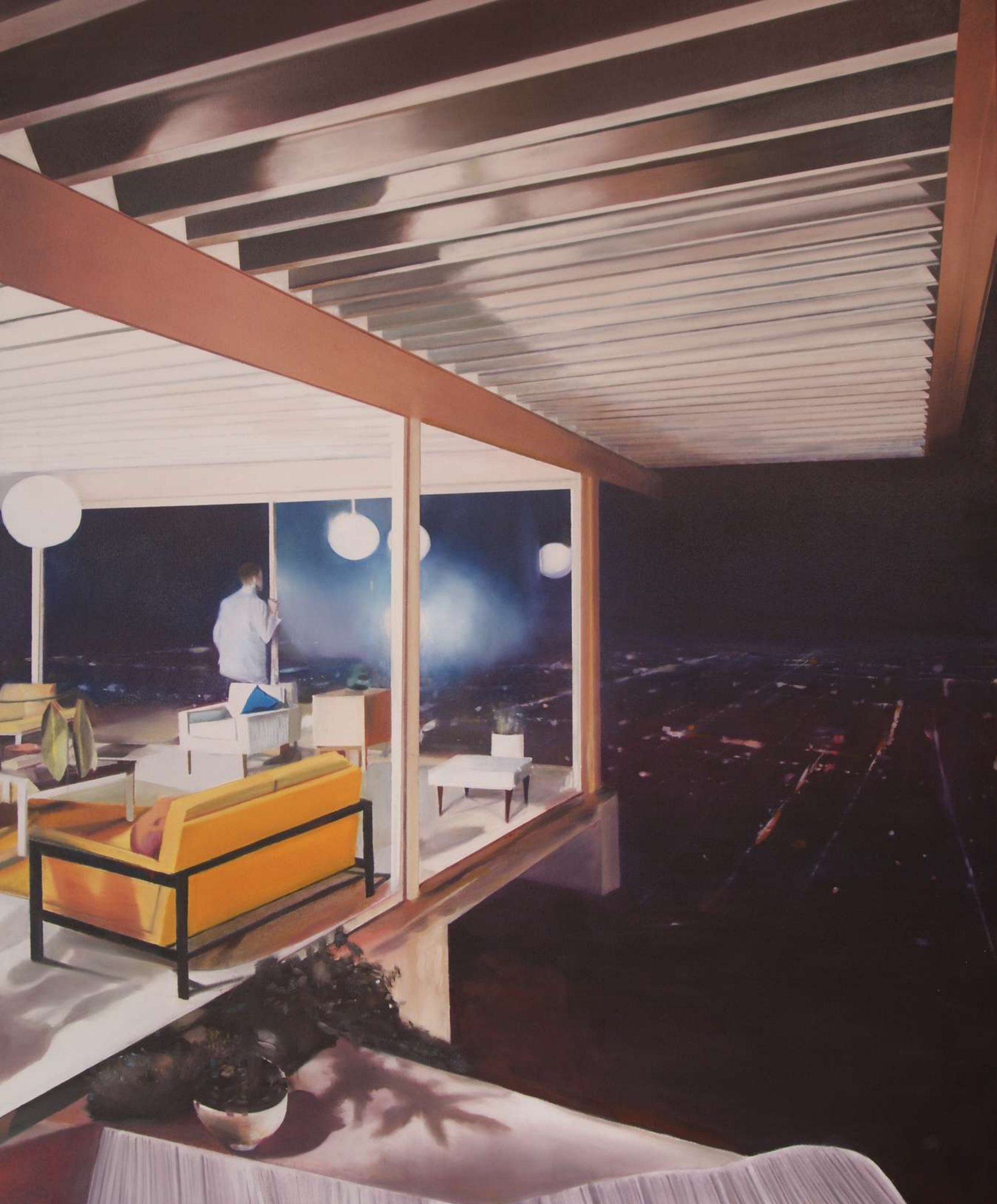
Alexandra Baraitser Design of Our Time 2022, Oil on canvas 140 x 115 cm £8850