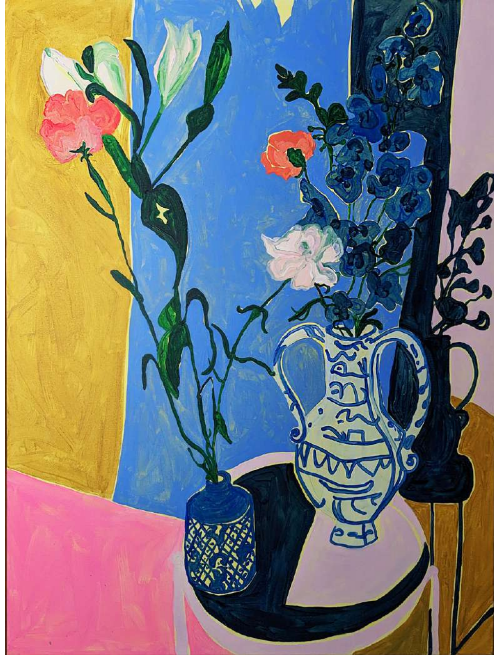
Elizabeth Power Ode to Jessiman 2023 Acrylic on canvas 106 x 80 cm £1800