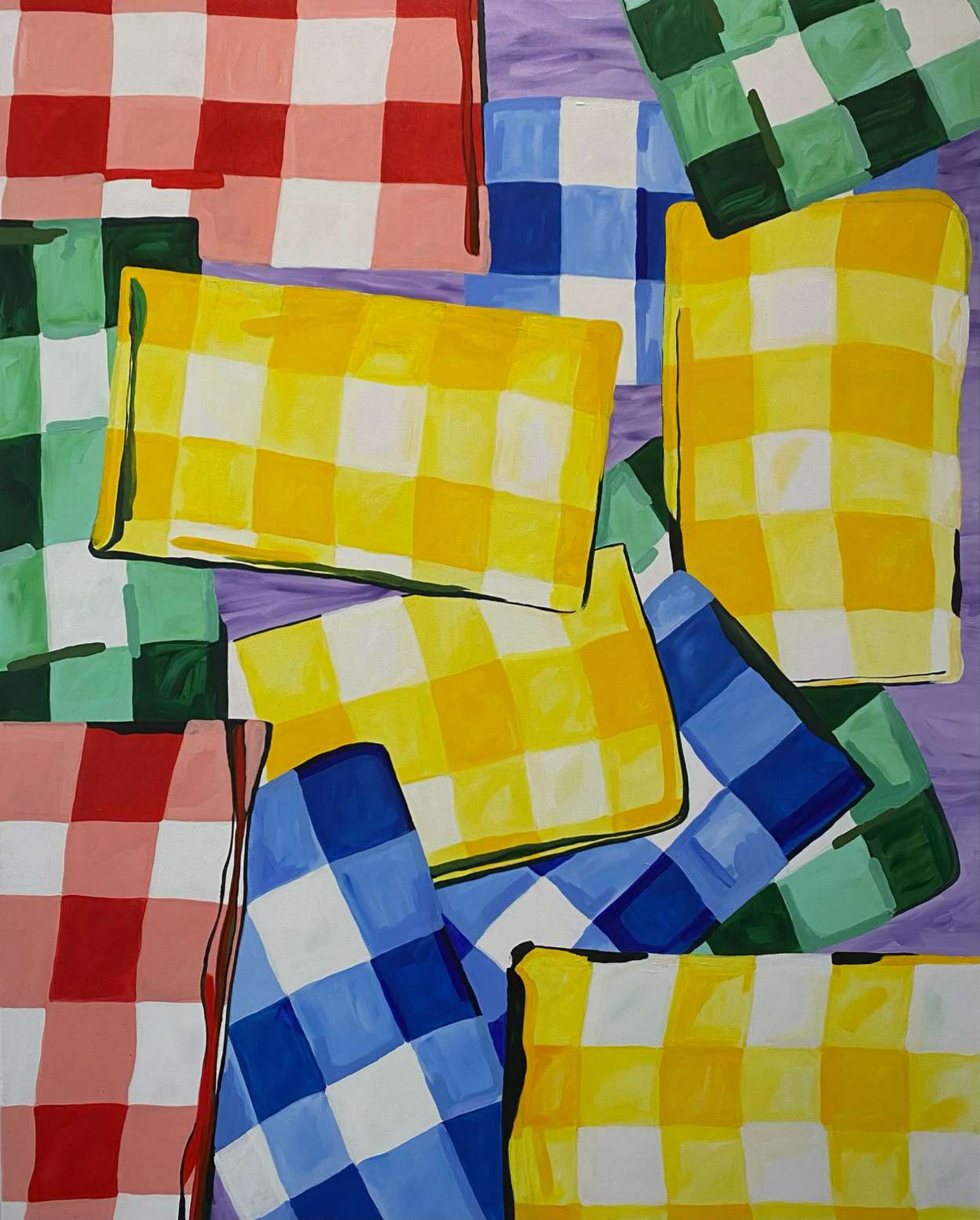
Pia Pack Table Talk No.16 2020 Oil on canvas 152 x 120 cm £4000