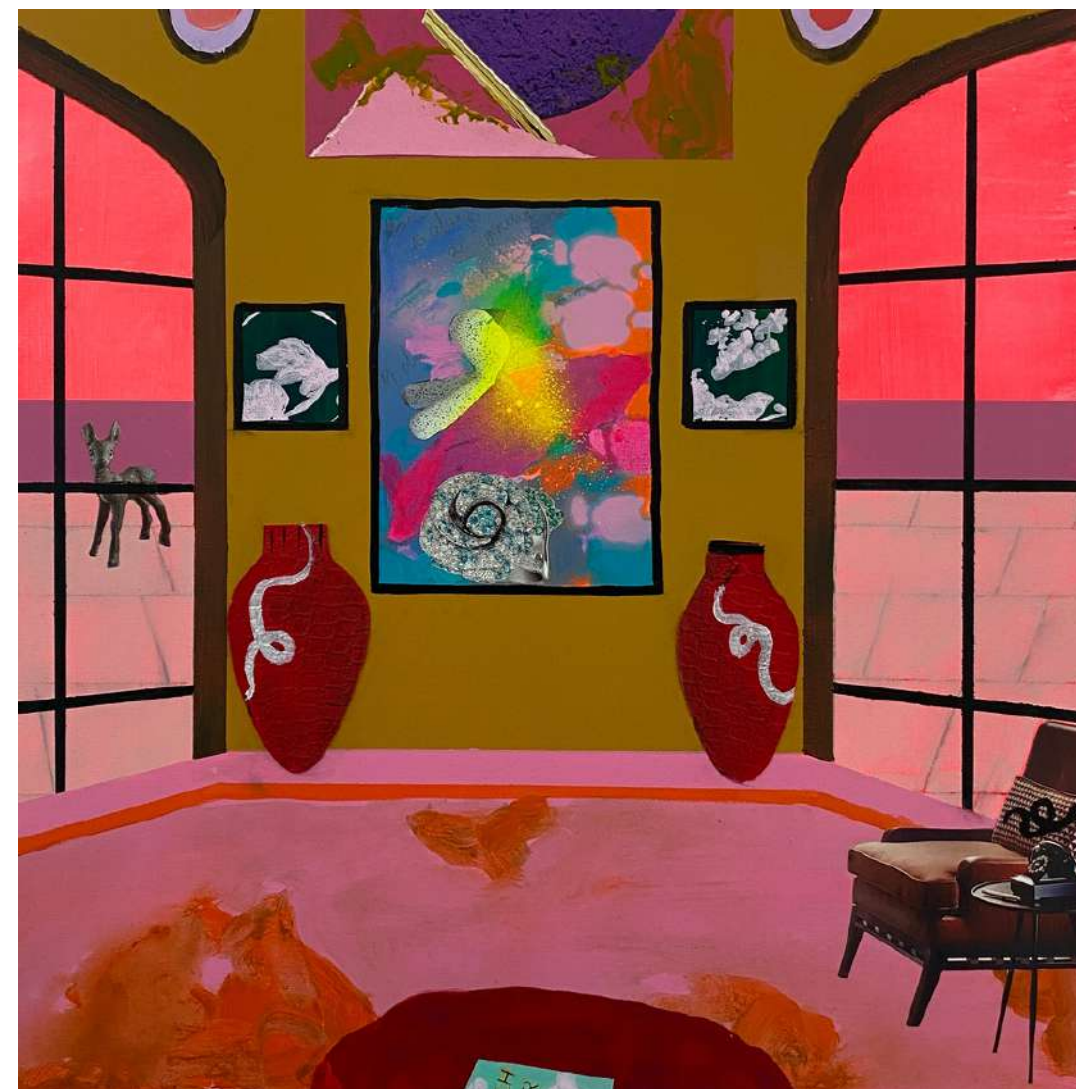
Dawn Beckles A Genuine Look Acrylic and collage on canvas 58 x 58 cm £1195