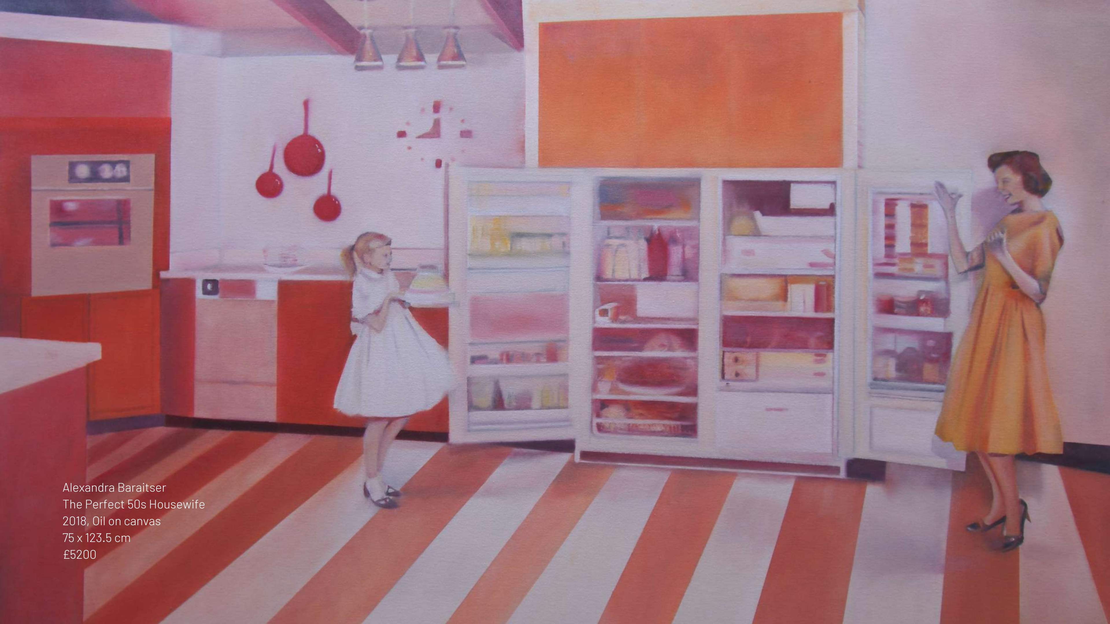
Alexandra Baraitser The Perfect 50s Housewife 2018, Oil on canvas 75 x 123.5 cm £5200