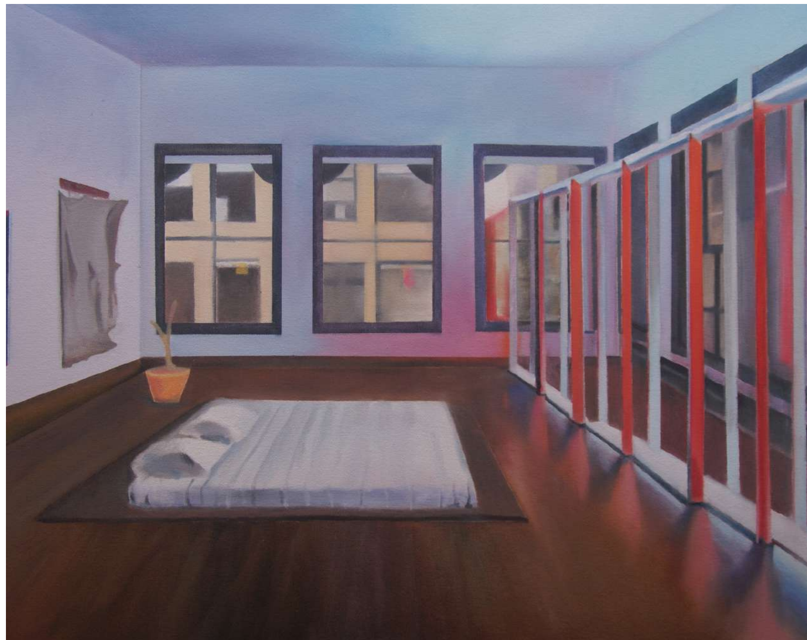
Alexandra Baraitser Donald Judd's Bedroom, 101 Spring Street NYC 2017, Oil on canvas 63.5 x 79 cm £2800