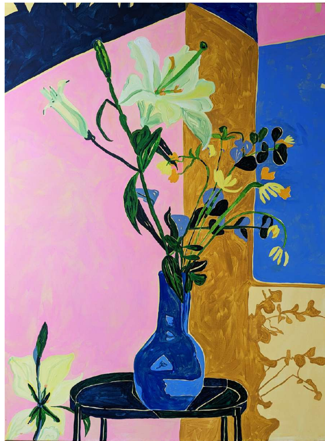
Elizabeth Power L'âme évaporée 2023 Acrylic on canvas 126 x 96 cm £2200