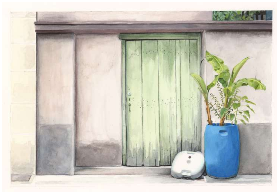
Lyle Perkins Aperture 01 2021, Watercolour and gouache on paper 36.3 x 44 cm £750