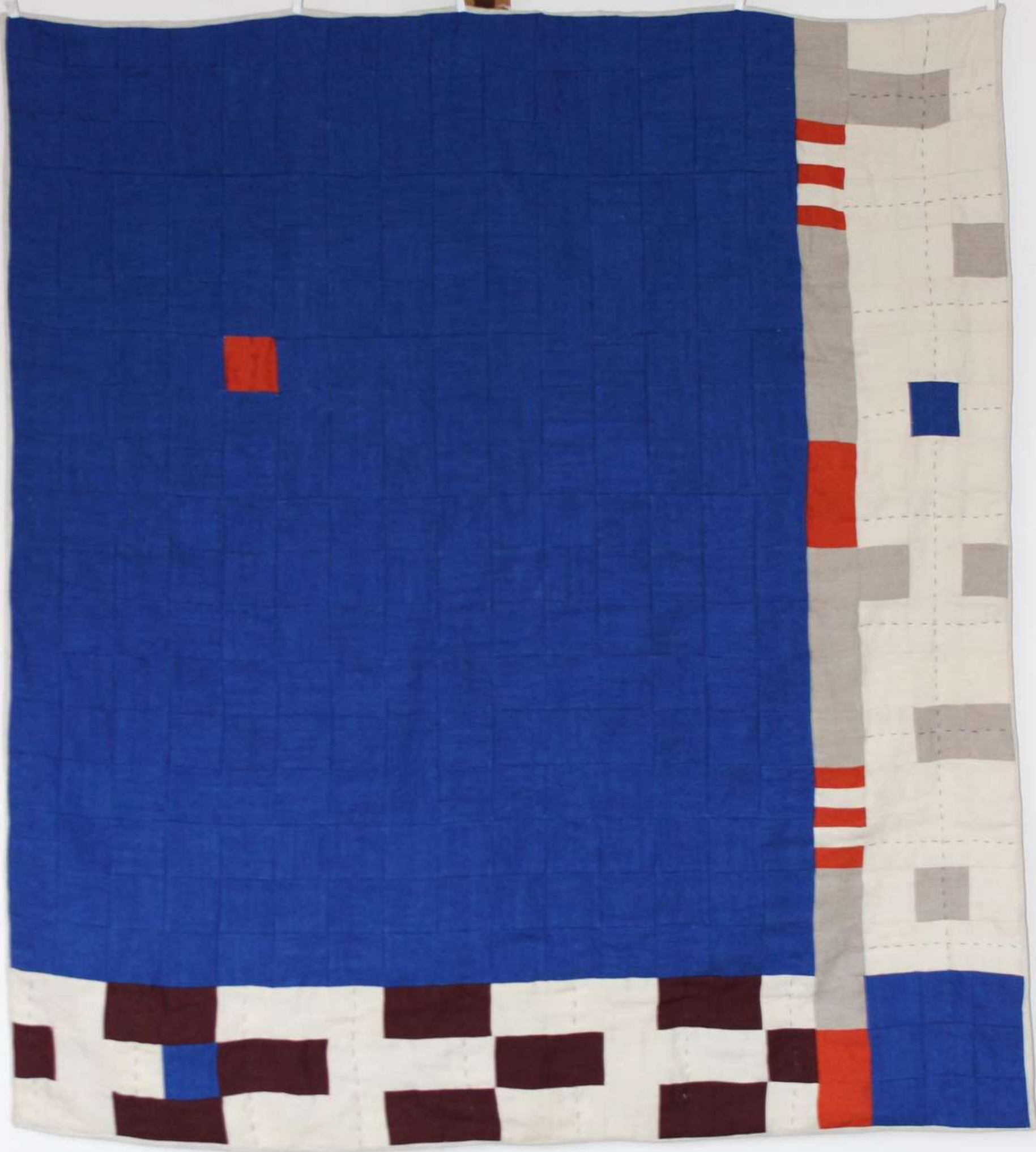
Ferren Gipson Untitled 2023, Linen, wool and cotton with hand-stitched sashiko thread 112 x 122 cm £10,000