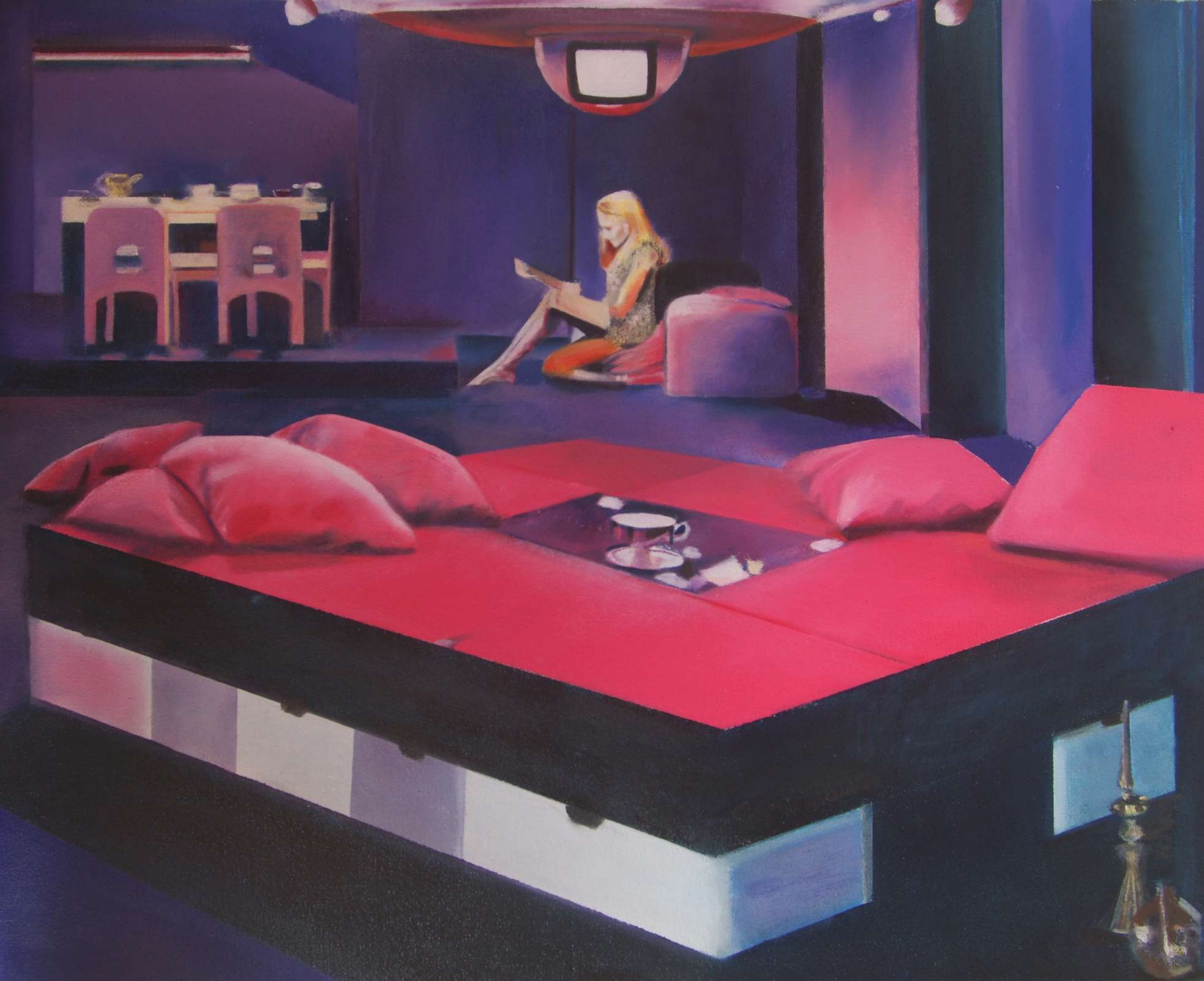
Alexandra Baraitser Panton's Girl 2019, Oil on canvas 54 x 66 cm £3000