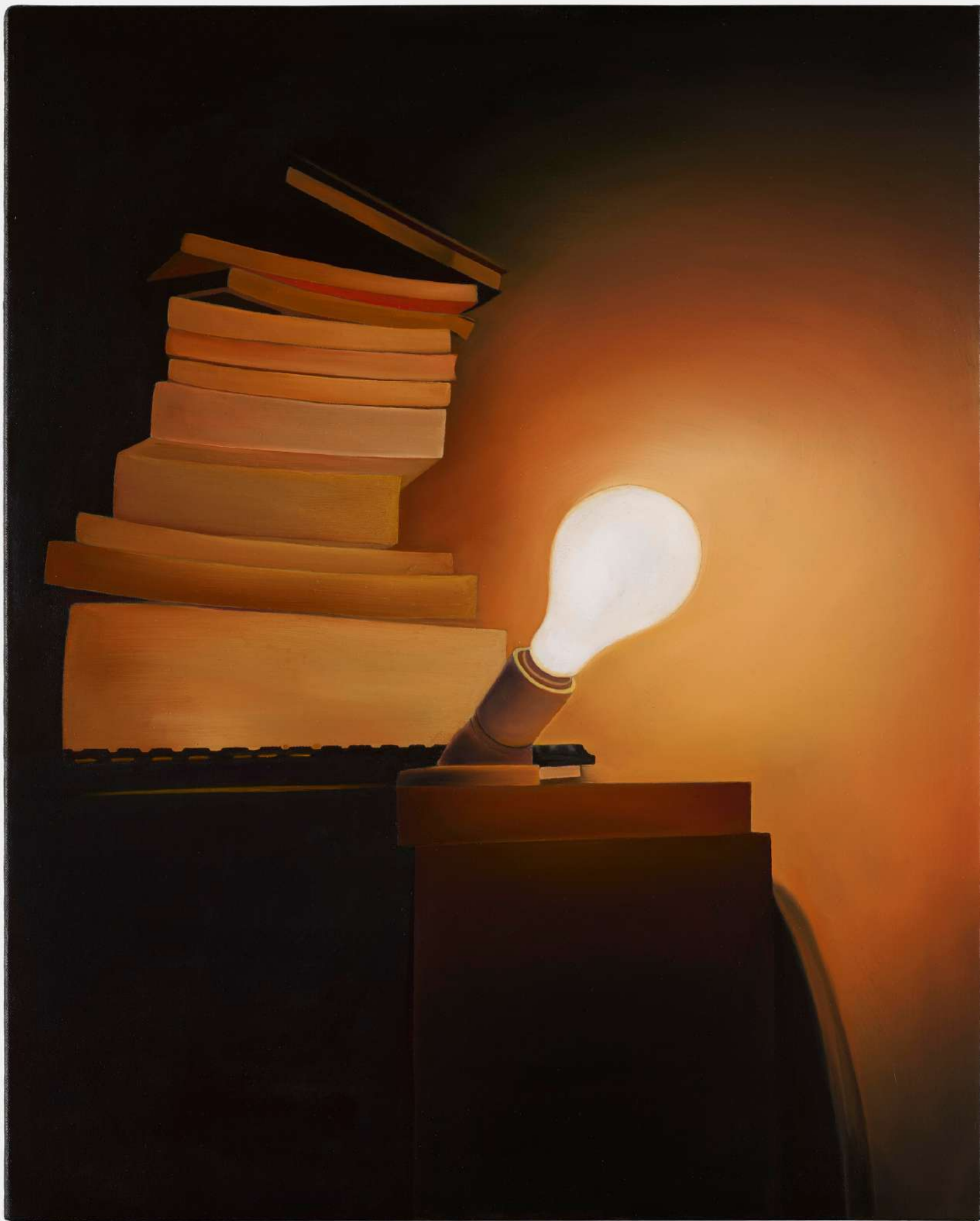
Lyle Perkins Southside 2019 Oil on canvas 50.8 x 41 cm £1750