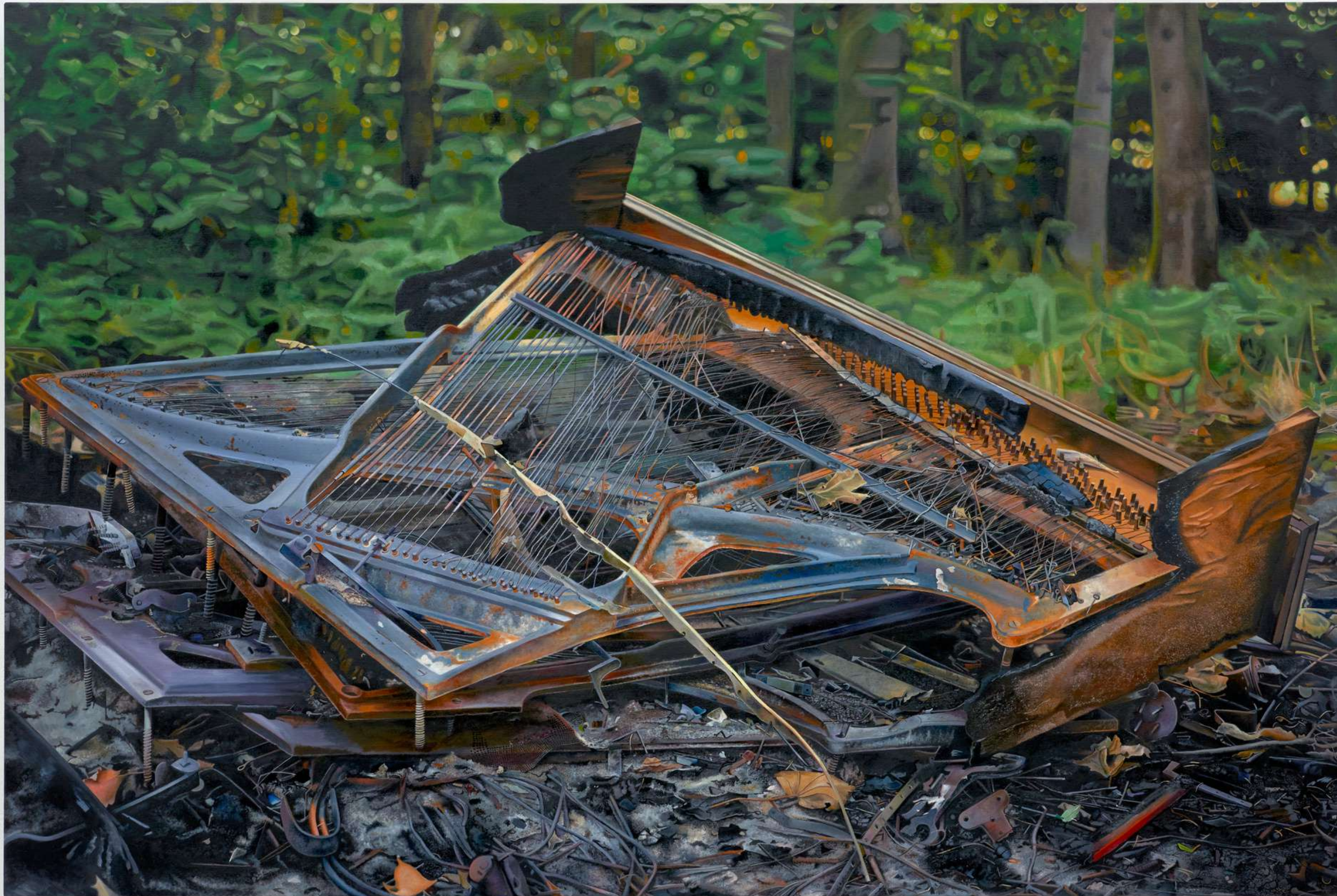
Lyle Perkins Ghost Notes 2023 Oil on Linen 122 x 183 cm £8000