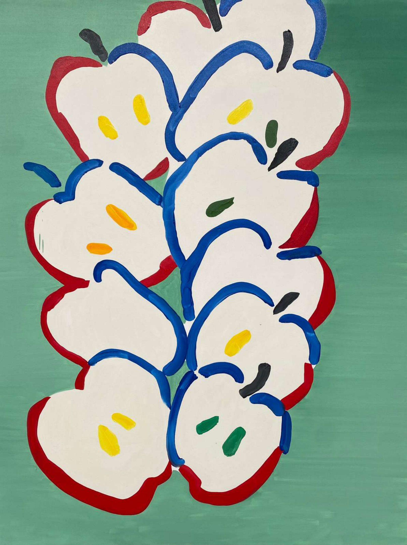
Pia Pack Apple A Day 2021 Oil on canvas 152 x 120 cm £4000