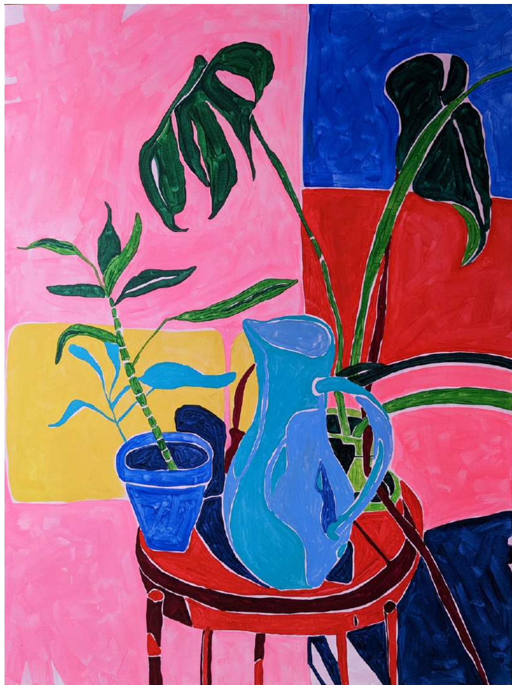
Elizabeth Power Pink and Plants 2023 Acrylic on canvas 106 x 80 cm £1800