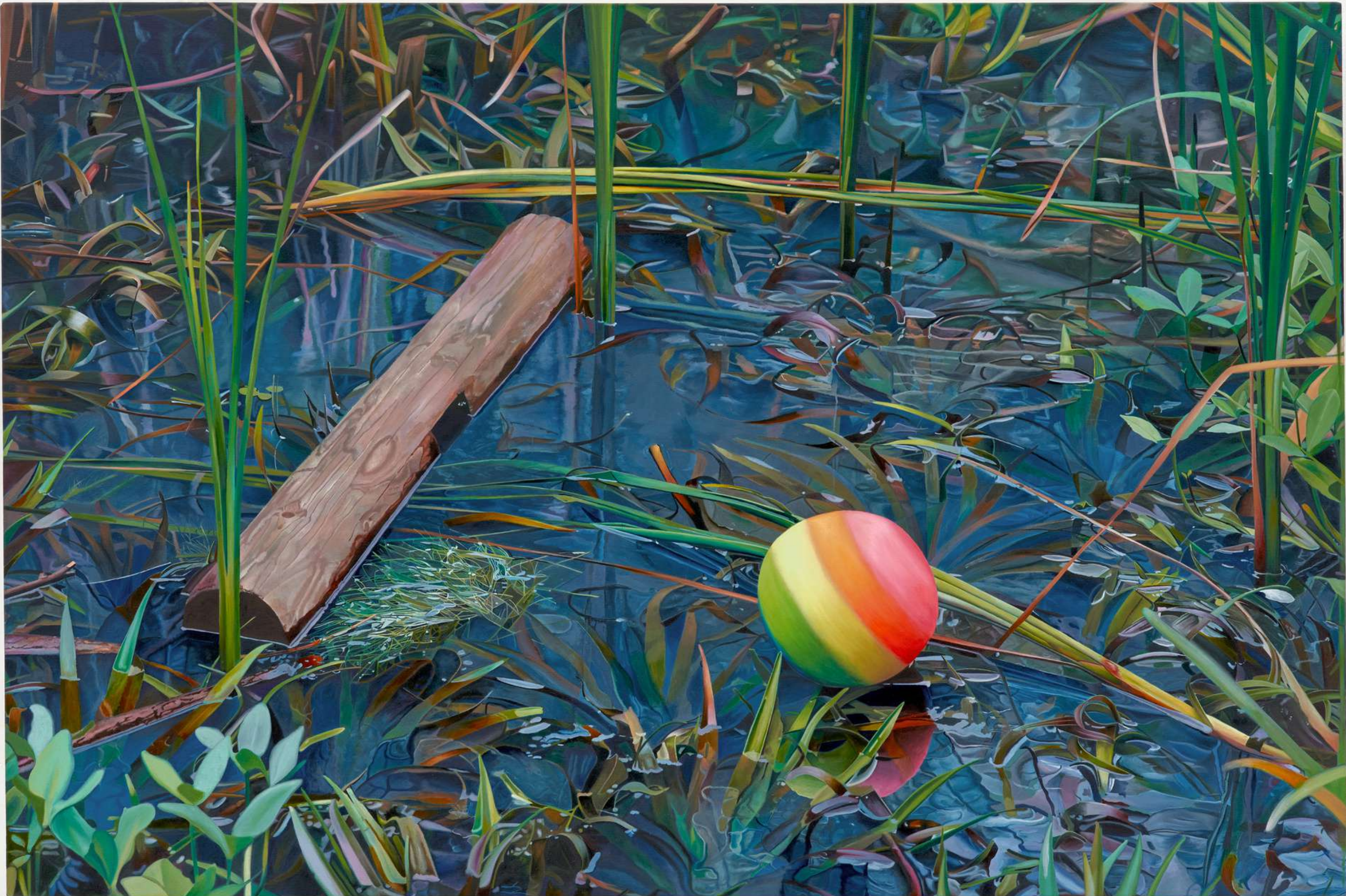
Lyle Perkins Ecology Centre 2022 Oil on canvas 101.6 x 152.4 cm £6500