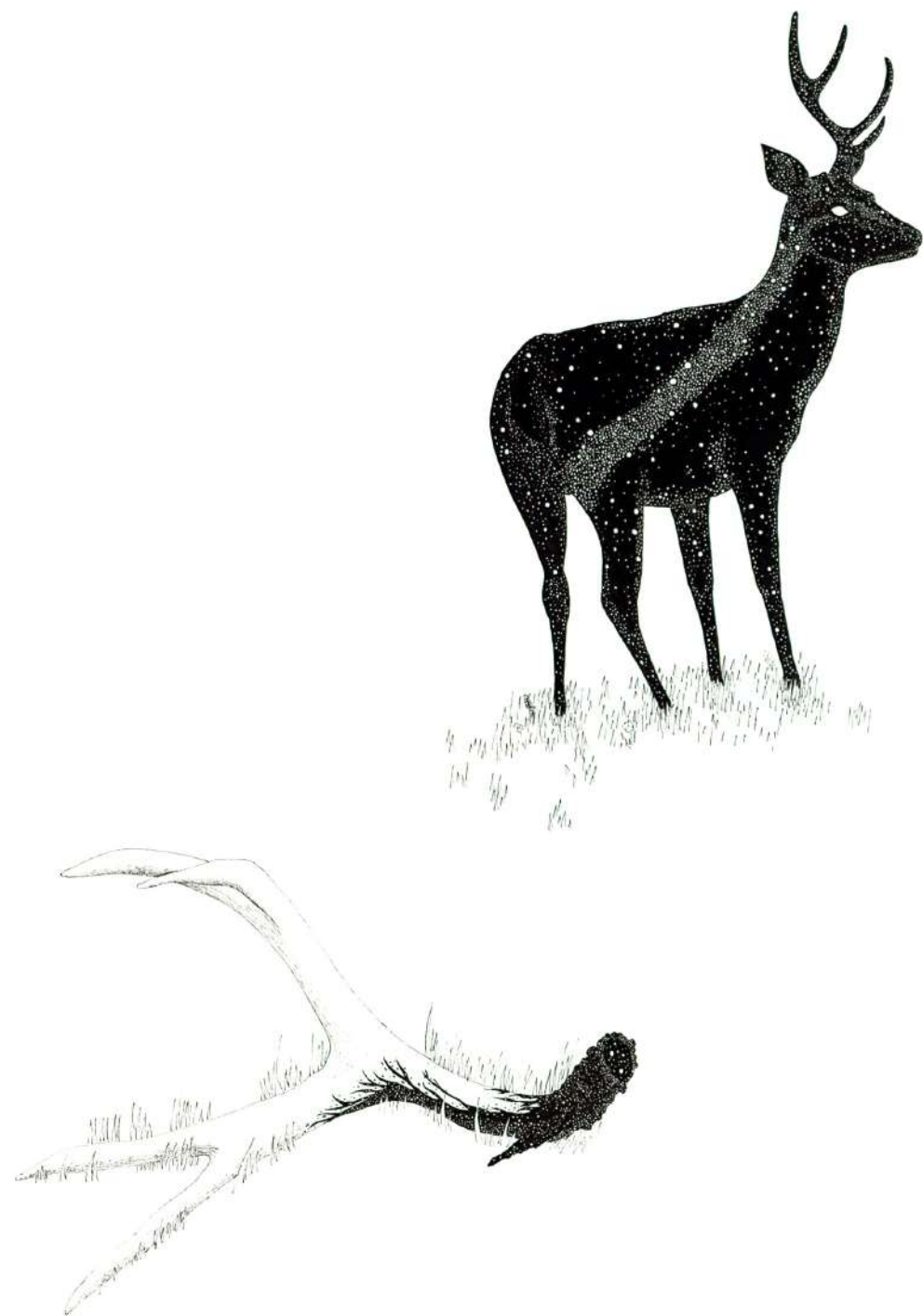
After Spring (Antler with Deer) 2022

Pigment ink drawing on paper Paper size: 35.5 x 41 cm Framed dimensions: 48.2 x 54.6 cm $1800