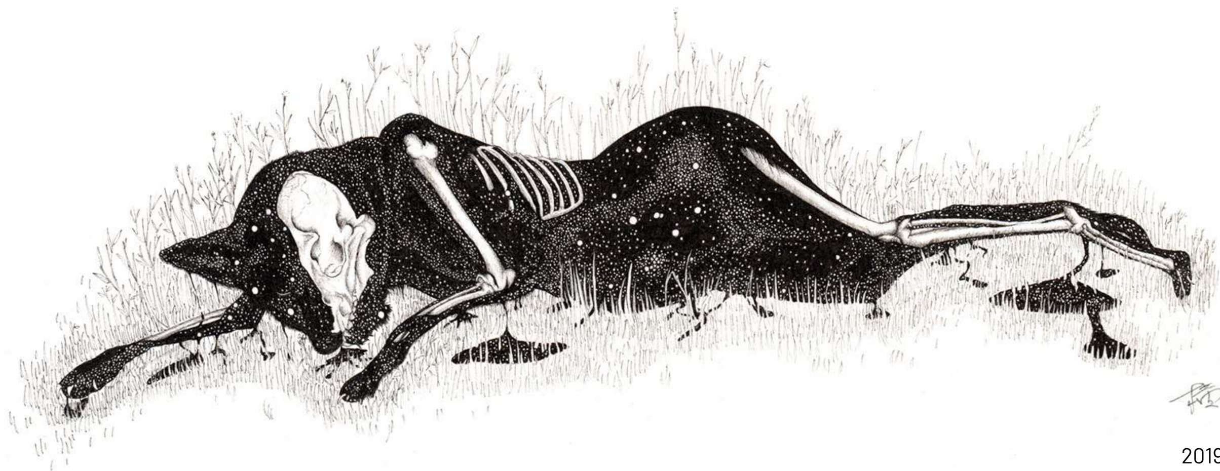
Deterioration 2019, Pigment ink drawing on paper Paper size: 55.8 x 76.2 cm Framed dimensions: 62.2 x 81.2 cm $4500