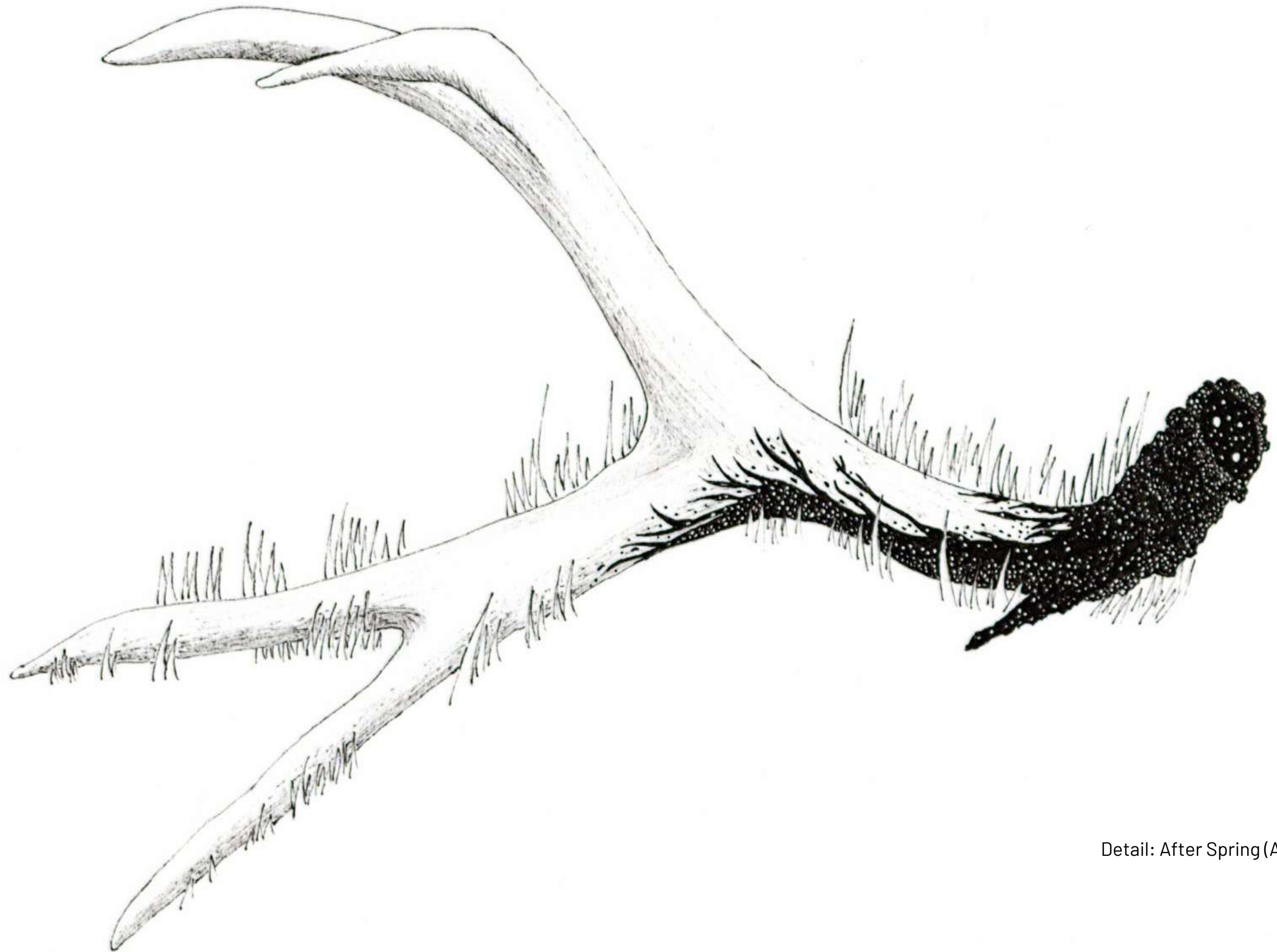
Detail: After Spring (Antler with Deer)