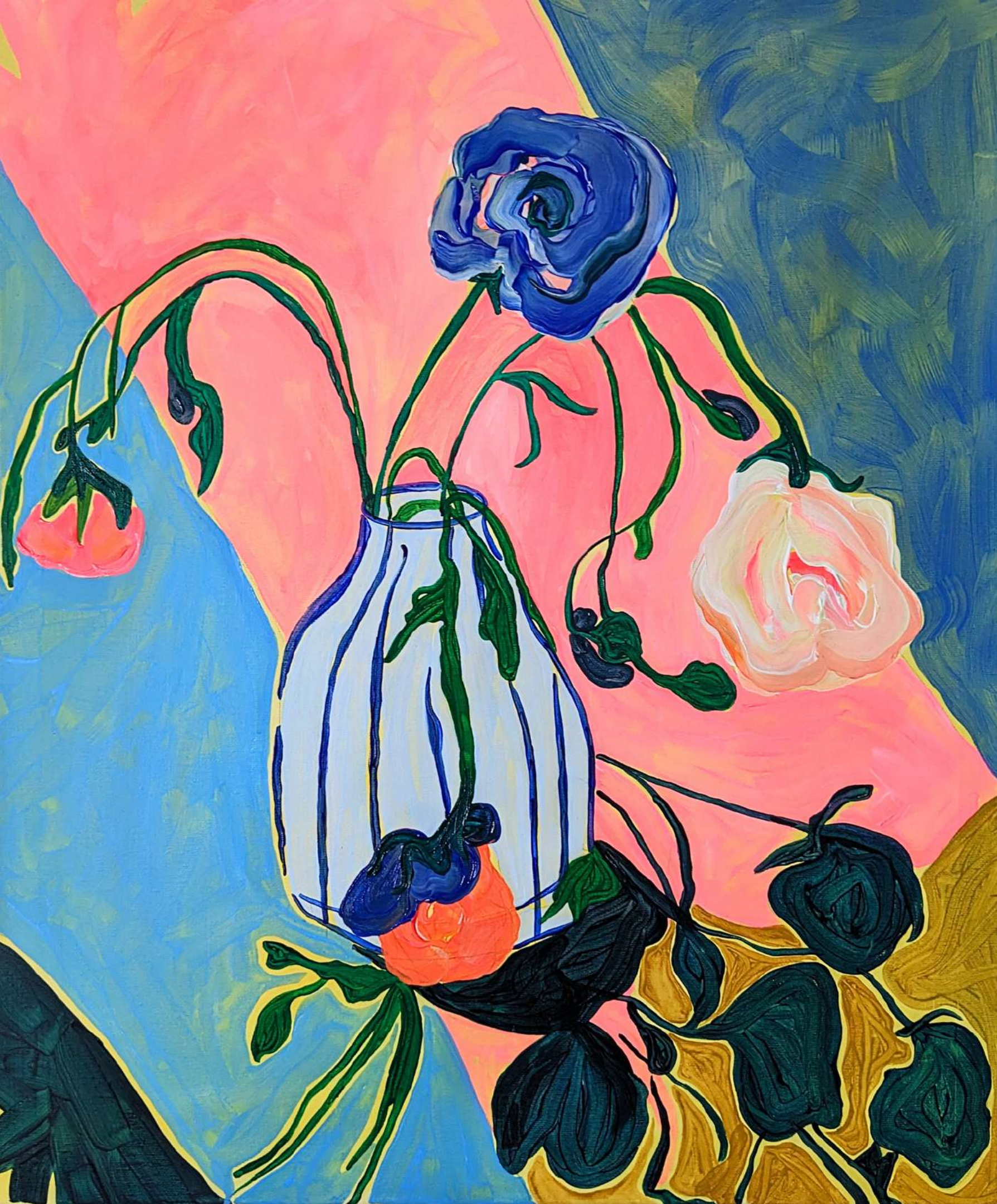
La Bambola 2024 Acrylic on canvas 50 x 60 cm £1400