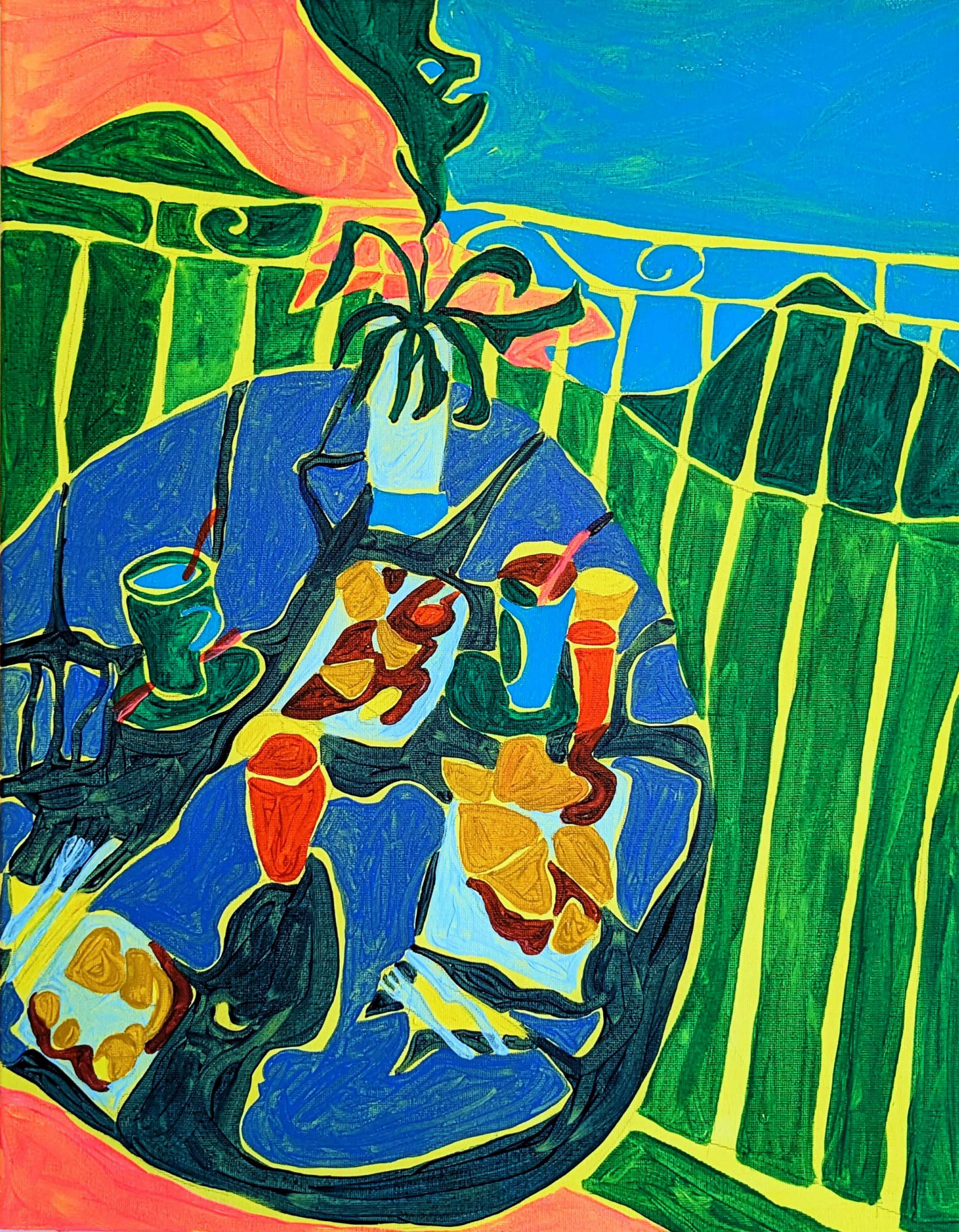
Oh Marie 2024 Acrylic on canvas 51 x 40 cm £1300