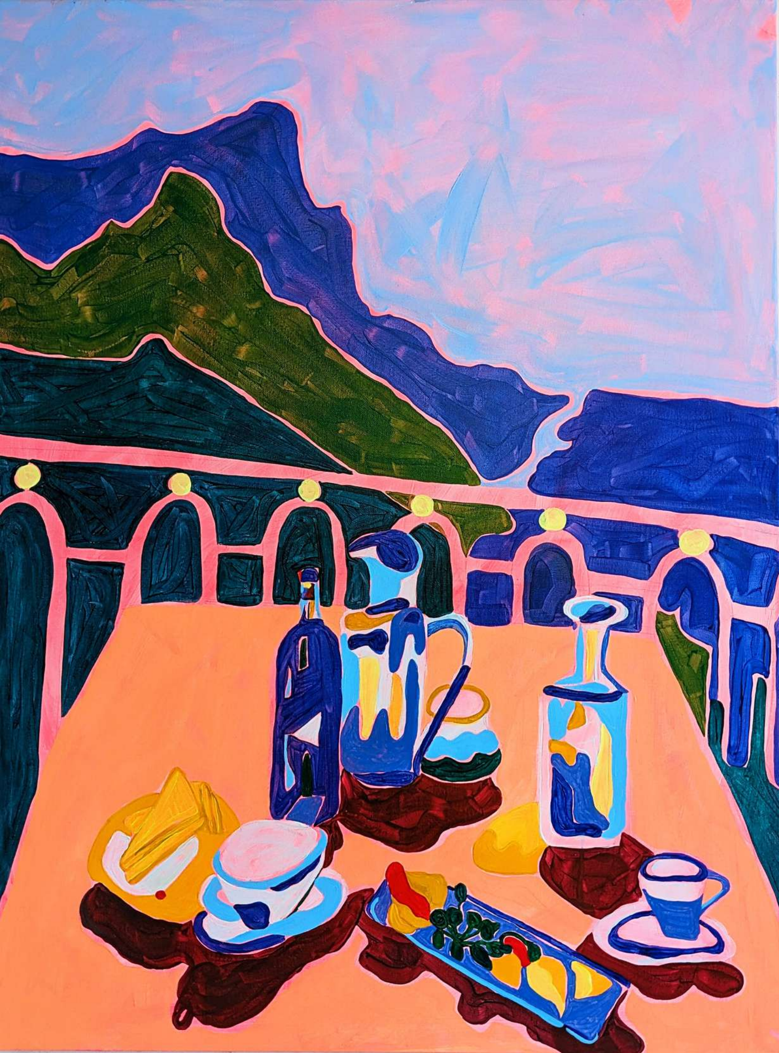
I Have But One Heart 2024 Acrylic on canvas 100 x 80 cm £2100