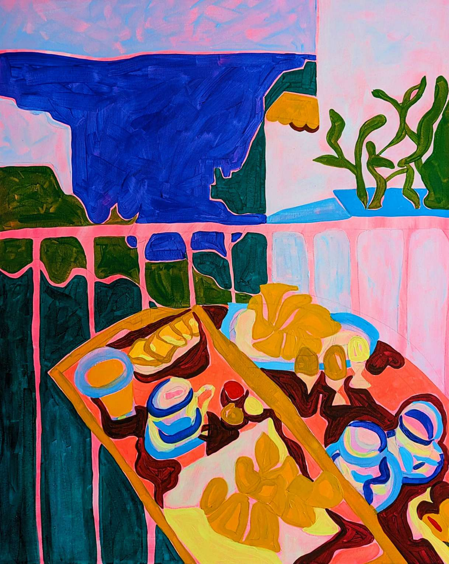
Azzurro 2024 Acrylic on canvas 100 x 80 cm £2100