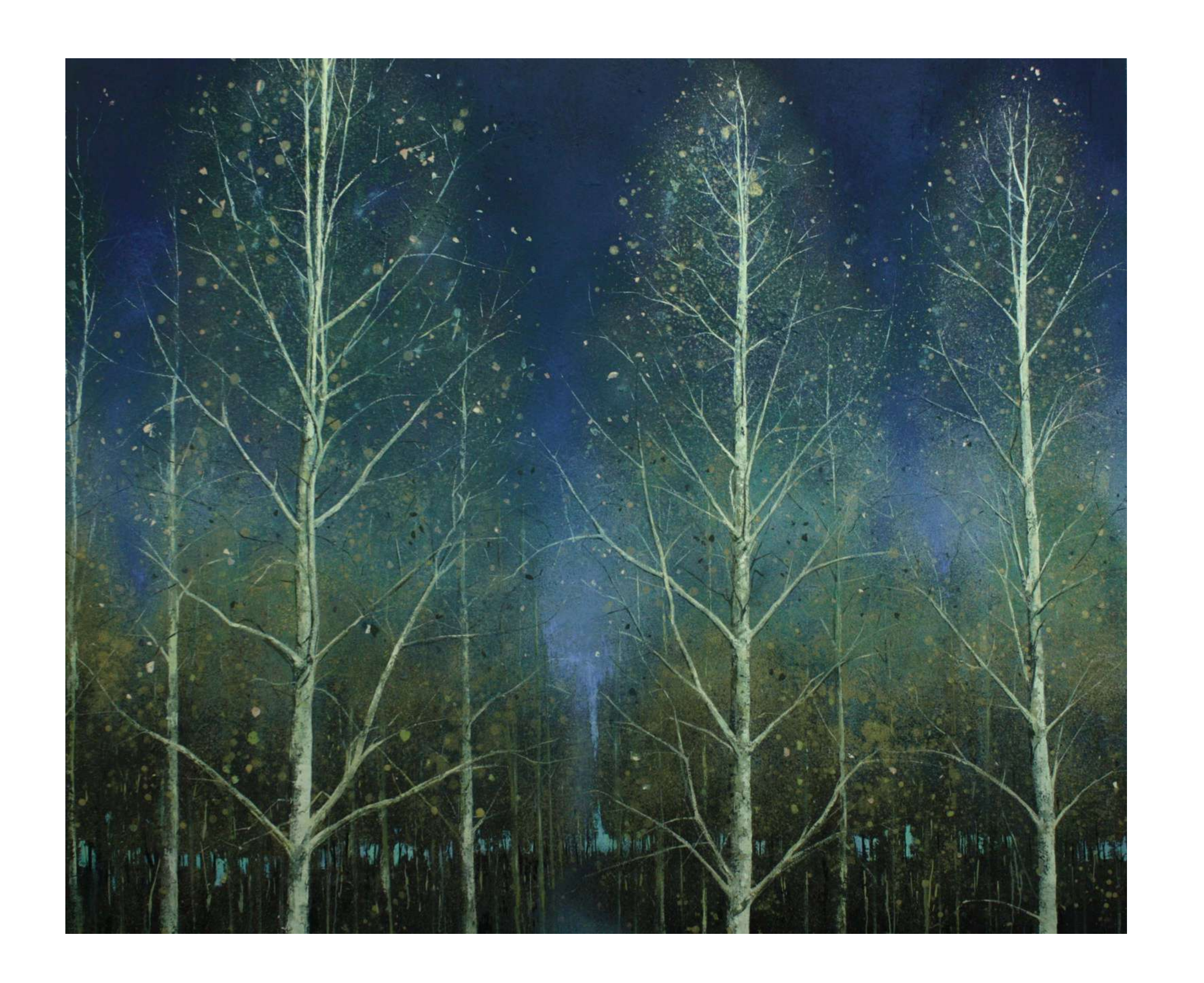
Ghosts Oil on canvas 152 x 183 cm £11,900