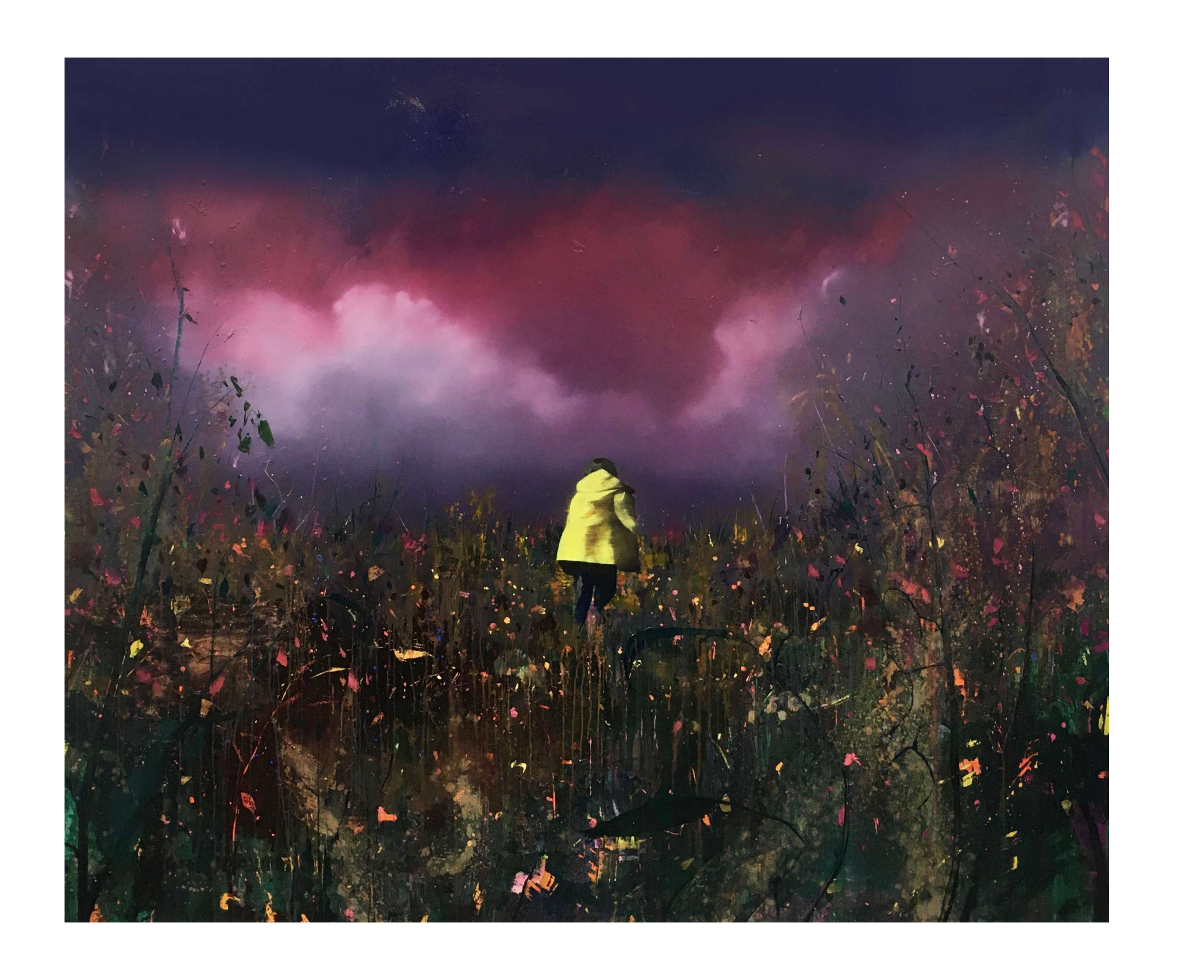
Departure Oil on canvas 152 x 183 cm £11,900