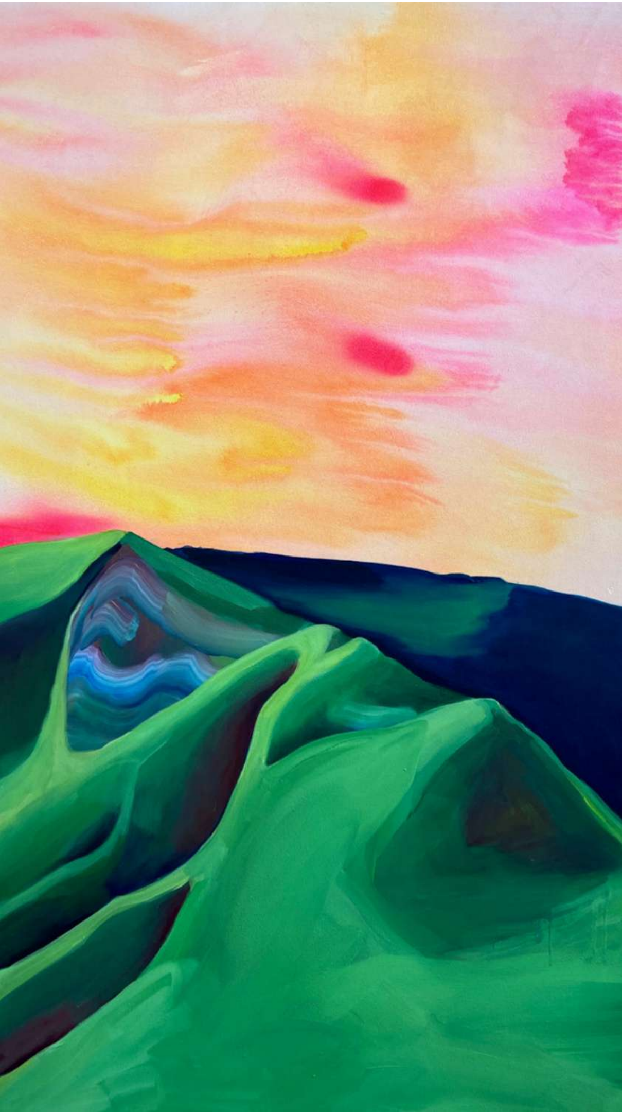
Rose Tinted 2024 Acrylic and spray paint on canvas 150 x 90 cm £2400