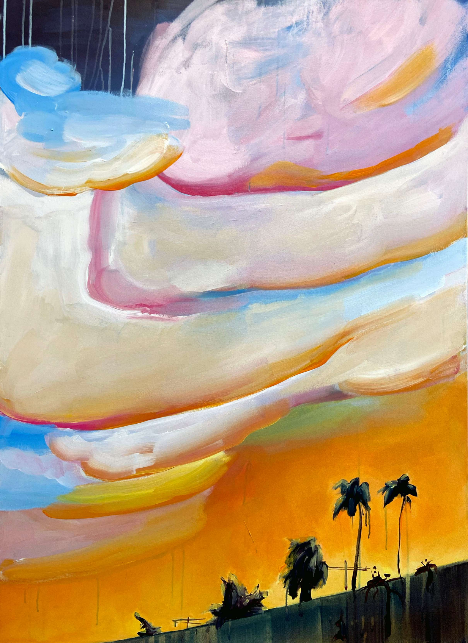
Road to Saturn 2022 Acrylic and flashe on canvas 140 x 100 cm £2000