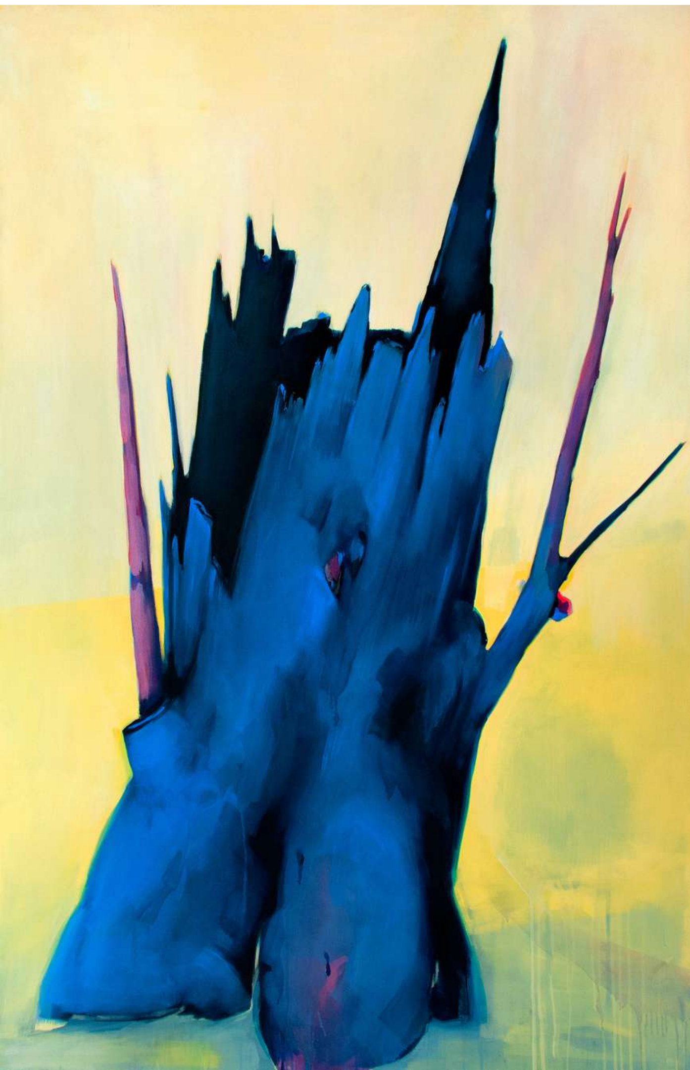
Hollowed Blue 2020 Acrylic and spray paint on canvas 200 x 160 cm £2800